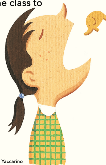
Illustration by Dan Yaccarino